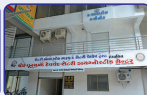
P.D. Shroff Rotary Diagnostic Centere