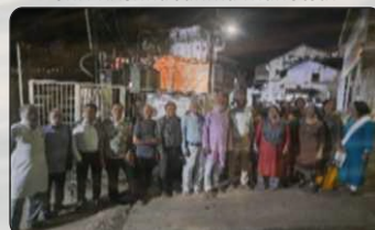
Food Packet Vitaran