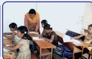
Hum Honge Kamyab - Literacy