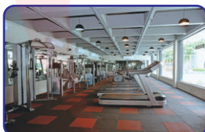
M. I. Patel Rotary Youth Center