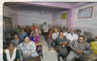
Aahar Utsav (Pathdan Kendra)