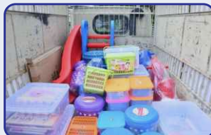
Mobile Toy Library - Ramakdu