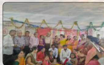
Shri Krishna Janma Mahotsav