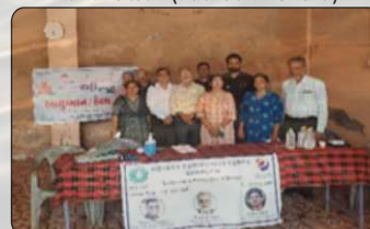
Nisulk Nidan & Sarvar Camp (RCC & Urban Dev. Bharuch)