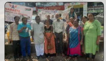
Anant Chaudash Chhash Vitaran (RCC & Arpan Foundation)