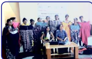
Women Empowerment Project